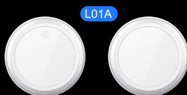
With T&H Sensor