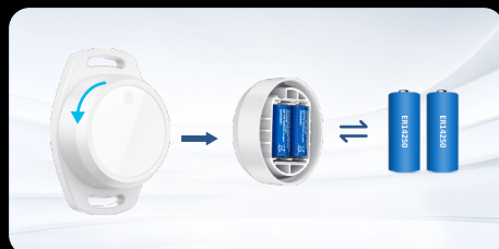
Rotating replaceable battery