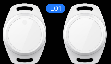
With T&H Sensor